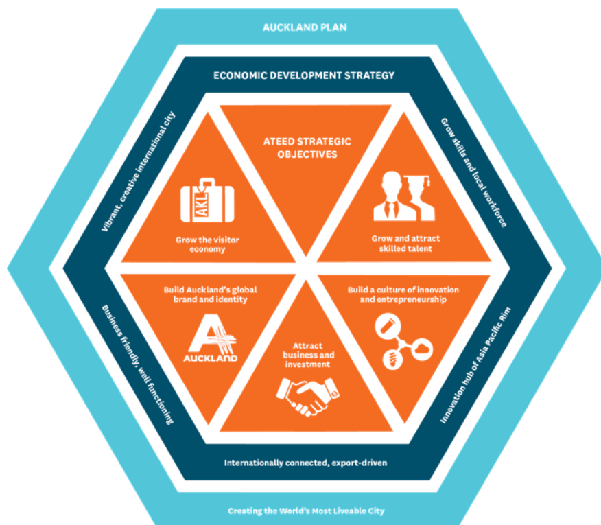
Figure 1: ATEED's strategic objectives

Through these objectives, we can connect Auckland-wide strategies (the Auckland Plan and Economic Development Strategy) and ATEED's ongoing strategic interventions, growth programmes and projects. The framework below provides the organisation with focus on those areas of our role that will make a difference to Auckland both regionally and locally. The key strategic objectives are supported by more detailed action plans, investment proposals and delivery partnerships.