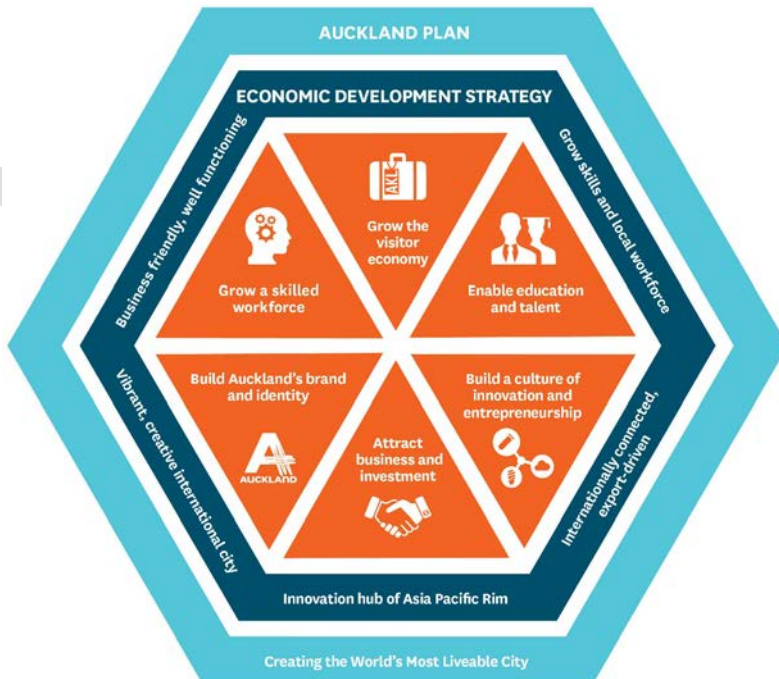
Figure 3: ATEED's Strategic Framework

Through these objectives we can connect Auckland wide strategies (Auckland Plan, Economic Development Strategy) and ATEED's ongoing strategic interventions, growth programmes and projects. The framework below provides the organisation with focus on those areas of our role that will make a difference to Auckland. The key strategic objectives are supported by more detailed action plans, investment proposals and delivery partnerships.